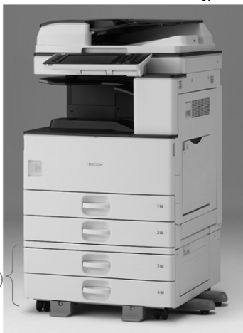
The photo shows the MP 3353SP with an optional Paper Feed Unit (X) attached. The environmental load of the optional unit is not included in the results.

※Figures in ( ) indicated environmental impact including recycle effect *note3