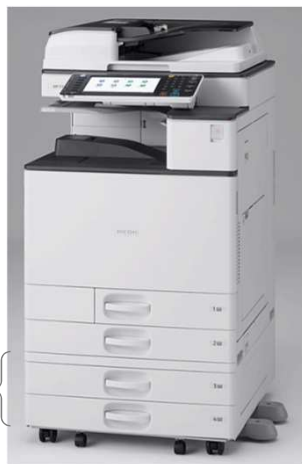
The photo shows the MP C2503SP with an optional Paper Bank Unit (※) attached. The environmental load of the optional unit is not included in the results.

※Figures in ( ) indicated environmental impact including recycle effect *note3