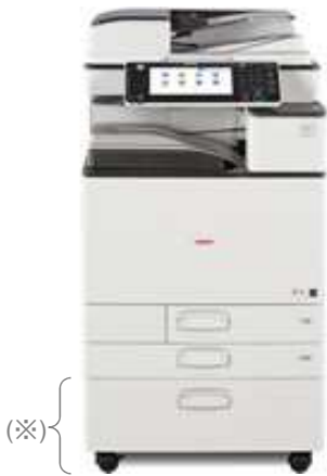
The photo shows the product with an optional Paper Bank Unit (※) attached. The environmental load of the optional unit is not included in the results.

※Figures in ( ) indicated environmental impact including recycle effect *note3