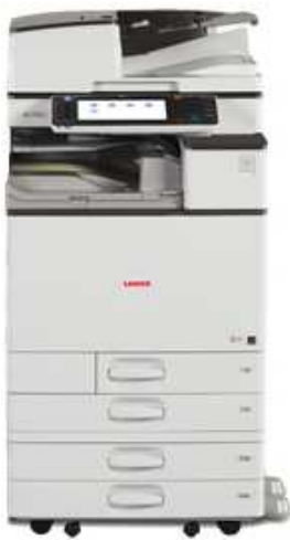
(※) The photo shows the product with an optional Paper Feed Unit (※) attached. The environmental load of the optional unit is not included in the results.

Environment Contact: RICOH Company, Ltd. Corporate Communication Center email : envinfo@ricoh.co.jp