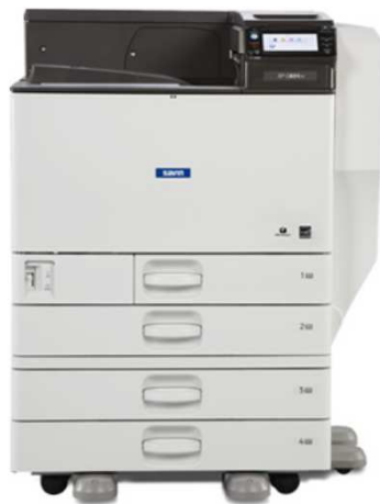
(※) The photo shows the product with an optional Paper Feed Unit (※) attached. The environmental load of the optional unit is not included in the results.

※Figures in ( ) indicated environmental impact including recycle effect *note3