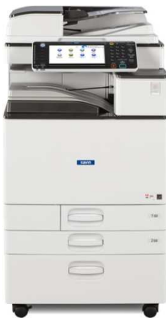
(※) The photo shows SAVIN MP C2003SPG with an optional Paper Bank Unit (※) attached. The environmental load of the optional unit is not included in the results.

※Figures in ( ) indicated environmental impact including recycle effect *note3