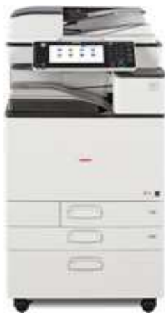
The photo shows LANIER MP C2003SPG with an optional Paper Bank Unit (⊗) attached. The environmental load of the optional unit is not included in the results.

※Figures in ( ) indicated environmental impact including recycle effect *note3