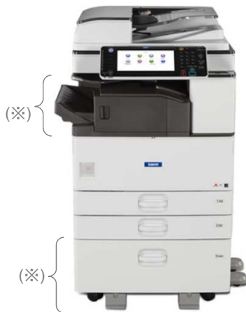
The photo shows the MP 2553SP with the optional units (X) attached. The environmental load of the optional units is not included in the results.

※Figures in ( ) indicated environmental impact including recycle effect *note3