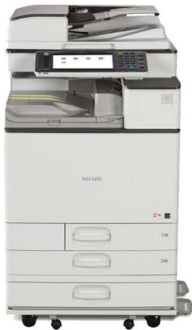
(※) The photo shows the product with an optional Paper Feed Unit (※) attached. The environmental load of the optional unit is not included in the results.

※Figures in ( ) indicated environmental impact including recycle effect *note3