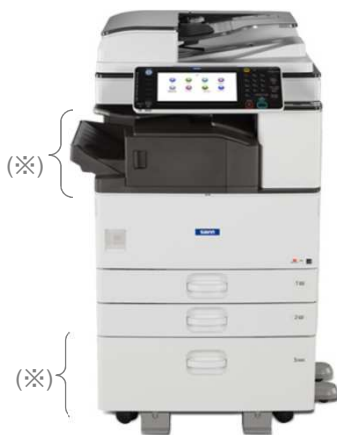
The photo shows the product with the optional units (X) attached. The environmental load of the optional units is not included in the results.

※Figures in ( ) indicated environmental impact including recycle effect *note3