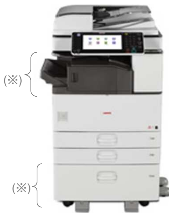
The photo shows the product with the optional units (X) attached. The environmental load of the optional units is not included in the results.

※Figures in ( ) indicated environmental impact including recycle effect *note3