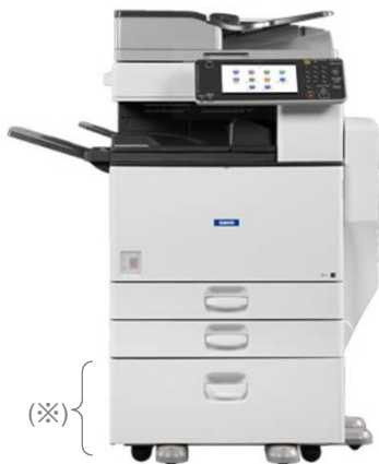
The photo shows the product with the optional unit (※) attached. The environmental load of the optional unit is not included in the results.

※Figures in ( ) indicated environmental impact including recycle effect. *note3