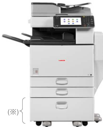
(※) The photo shows the product with the optional unit (※) attached. The environmental load of the optional unit is not included in the results.

※Figures in ( ) indicated environmental impact including recycle effect. *note3