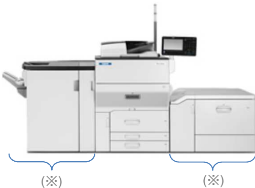
The photo shows the product with optional units (X) attached. The environmental loads of these units are not included in the results.

※Figures in ( ) indicated environmental impact including recycle effect *note3