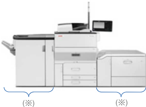
The photo shows the product with optional units (X) attached. The environmental loads of these units are not included in the results.

※Figures in ( ) indicated environmental impact including recycle effect *note3