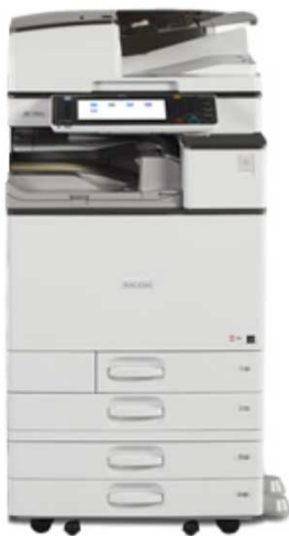
(※) The photo shows the product with an optional Paper Feed Unit (※) attached. The environmental load of the optional unit is not included in the results.

The warming load of the Use stage is based on the supposition that the product prints 1,804,800 images for five years.