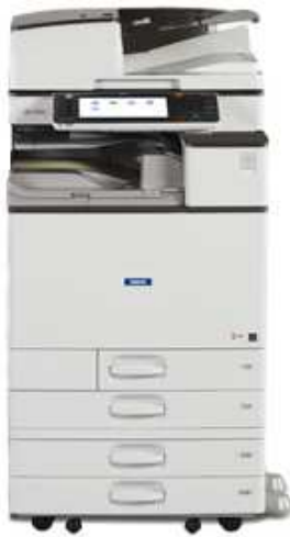
(※) The photo shows the product with an optional Paper Feed Unit (※) attached. The environmental load of the optional unit is not included in the results.

Environment Contact: RICOH Company, Ltd. Corporate Communication Center email : envinfo@ricoh.co.jp