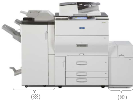
The photo shows the product with optional units (※) attached. The environmental loads of these units are not included in the results.

※Figures in ( ) indicated environmental impact including recycle effect *note3