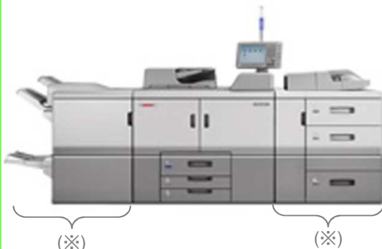
The photo shows the product with optional units (X) attached. The environmental loads of these units are not included in the results.

※Figures in ( ) indicated environmental impact including recycle effect *note3