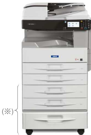
The photo shows the product with the optional units (※) attached. The environmental loads of the optional units are not included in the results.

※Figures in ( ) indicated environmental impact including recycle effect *note3