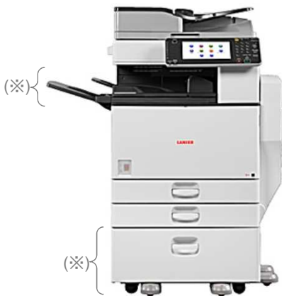
The photo shows the product with the optional units (※) attached. The environmental loads of the optional units are not included in the results.

※Figures in ( ) indicated environmental impact including recycle effect *note3