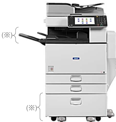
The photo shows the product with the optional units (※) attached. The environmental loads of the optional units are not included in the results.

※Figures in ( ) indicated environmental impact including recycle effect *note3