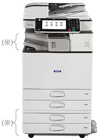
The photo shows the product with the optional units (※) attached. The environmental loads of the optional units are not included in the results.

※Figures in ( ) indicated environmental impact including recycle effect *note3