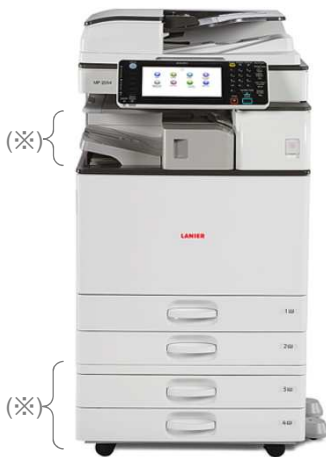
The photo shows the product with the optional units (※) attached. The environmental loads of the optional units are not included in the results.

※Figures in ( ) indicated environmental impact including recycle effect *note3