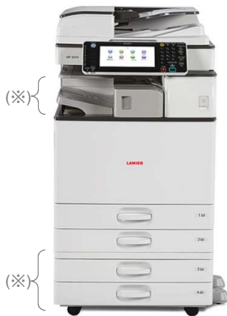
The photo shows the product with the optional units (X) attached. The environmental loads of the optional units are not included in the results.

※Figures in ( ) indicated environmental impact including recycle effect *note3