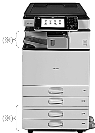
The photo shows the product with the optional units (X) attached. The environmental loads of these optional units are not included in the results.

※Figures in ( ) indicated environmental impact including recycle effect *note3