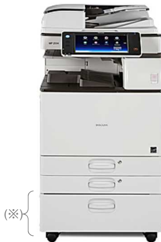
The photo shows the product with the optional units (※) attached. The environmental load of the optional unit is not included in the results.

※Figures in ( ) indicated environmental impact including recycle effect *note3