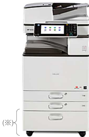
The photo shows the product with the optional units (※) attached. The environmental load of the optional unit is not included in the results.

※Figures in ( ) indicated environmental impact including recycle effect *note3