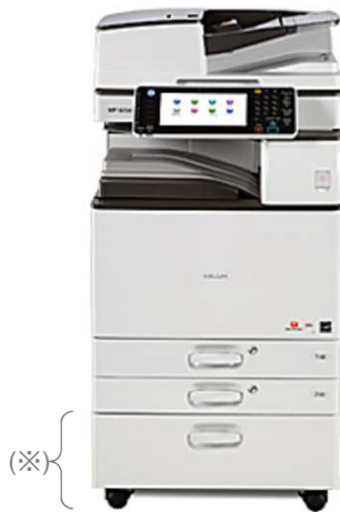
The photo shows the product with the optional units (※) attached. The environmental load of the optional unit is not included in the results.

※Figures in ( ) indicated environmental impact including recycle effect *note3