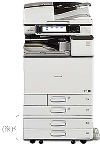
The photo shows the product with optional Paper Feed Unit (※) attached. The environmental load of the optional unit is not included in the results.

The warming load of the Use stage is based on the supposition that the product prints 1,190,400 images for five years. The environmental impact derived from paper itself is not included as prescribed in the PCR.