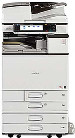
(※) The photo shows the product with an optional Paper Feed Unit (※) attached. The environmental load of the optional unit is not included in the results.

※Figures in ( ) indicated environmental impact including recycle effect *note3