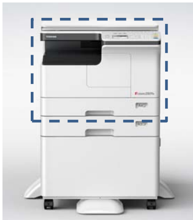
Paper Feed Unit and Desk are optional