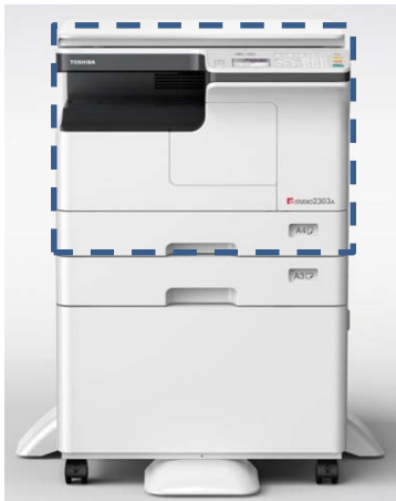
Paper Feed Unit and Desk are optional