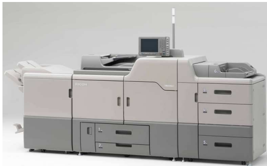
The photo shows the RICOH Pro C751EX with the 13" x 19.2" Large Capacity Tray and the SR5040 Finisher attached.

※Figures in ( ) indicated environmental impact including recycle effect *note3