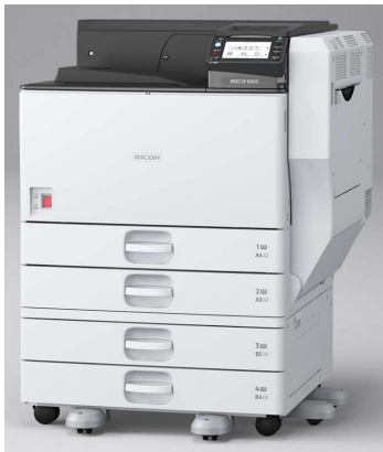
The photo shows the Aficio SP 8300DN with the Paper Feed Unit (option) attached.

※Figures in ( ) indicated environmental impact including recycle effect. *note3