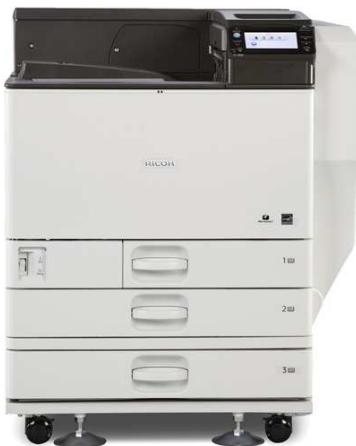
The photo shows the Aficio SP C830DN with the Paper Feed Unit (option) attached.

※Figures in ( ) indicated environmental impact including recycle effect *note3