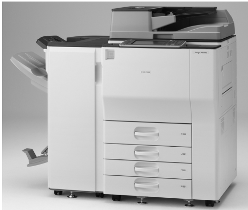
The photo shows the Aficio MP 7502SP with 2,000-Sheet Finisher SR4070 (option) attached.

※Figures in ( ) indicated environmental impact including recycle effect *note3