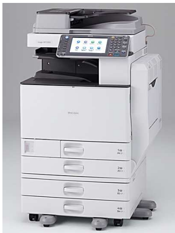
The photo shows the Aficio MP C3002G with the Paper Bank Unit (option) attached.

Environment Contact: RICOH Company, Ltd. Corporate Communication Center email : envinfo@ricoh.co.jp