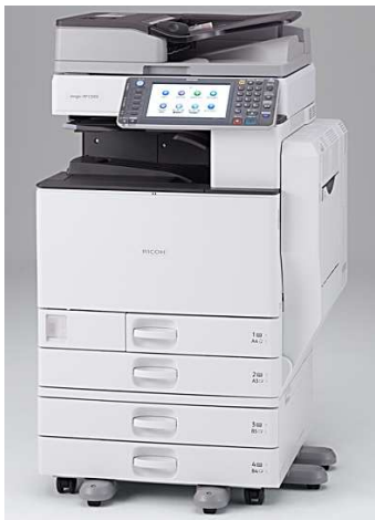
The photo shows the Aficio MP C4502G with the Paper Bank Unit (option) attached.

Environment Contact: RICOH Company, Ltd. Corporate Communication Center email : envinfo@ricoh.co.jp