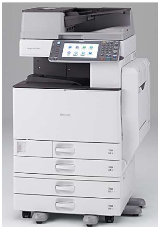
The photo shows the Aficio MP C5502A with the Paper Bank Unit (option) attached.

Environment Contact: RICOH Company, Ltd. Corporate Communication Center email : envinfo@ricoh.co.jp