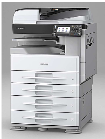
The photo shows the MP 2501SP with an optional Paper Bank unit attached. The environmental load of the optional unit is not included in the results.

Environment Contact: RICOH Company, Ltd. Corporate Communication Center email : envinfo@ricoh.co.jp