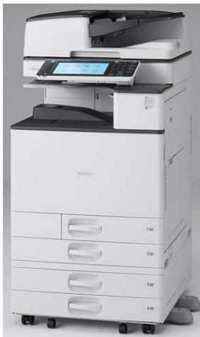
The photo shows the MP C4503SP with the Two-Tray Paper Bank (option) attached.

Environment Contact: RICOH Company, Ltd. Corporate Communication Center email : envinfo@ricoh.co.jp