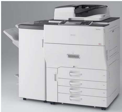
The photo shows the MP C6502SP with the SR4100 Finisher Unit (option) attached.

The warming load of the Use stage is based on the supposition that the product prints 2,534,400 images for five years.