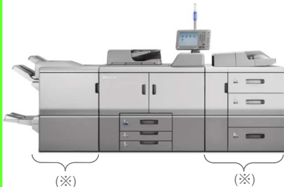
The photo shows the product with optional units (X) attached. The environmental loads of these units are not included in the results.

※Figures in ( ) indicated environmental impact including recycle effect *note3