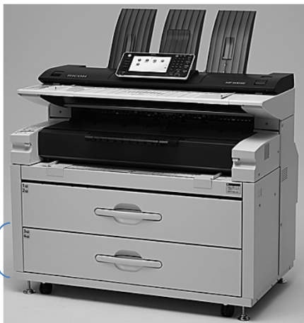
The environmental load of the optional 2nd Roll Feeder unit (※) is included in the results.

※Figures in ( ) indicated environmental impact including recycle effect *note3